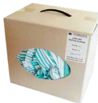
Low Lint Cloths

For newly-galvanised steel, please ensure that any sharp points have been removed, and that it is thoroughly dry and free from dust, oil or grease before painting. Wiping the work over with our Brundle Panelwipe is an excellent preparation. If the galvanising is very shiny, it may require abrading or a pre-treatment such as Brundle Mordant 'T' Wash for best results as this will aid adhesion.